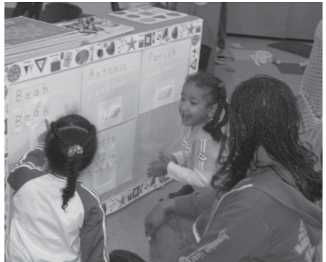
Children at Beautiful Beginnings Child Care Center practicing alphabet play with each other's names.