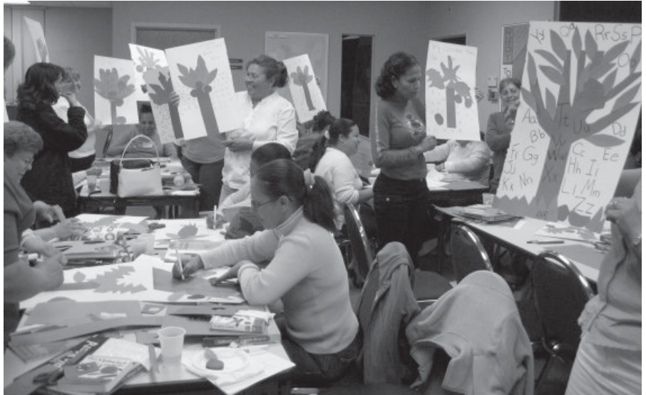
HUR Club members at R2LP creating an activity associated with the children's book Chicka Chicka Boom Boom which they can take back to use in their family care settings.