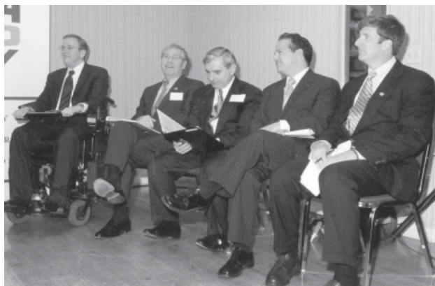
Speakers included Congressman Langevin, Governor Carcieri, Senator Reed, Mayor Cicilline, and Congressman Kennedy.